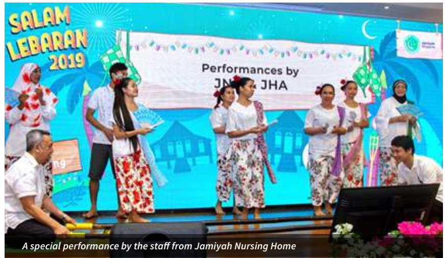
A special performance by the staff from Jamiyah Nursing Home