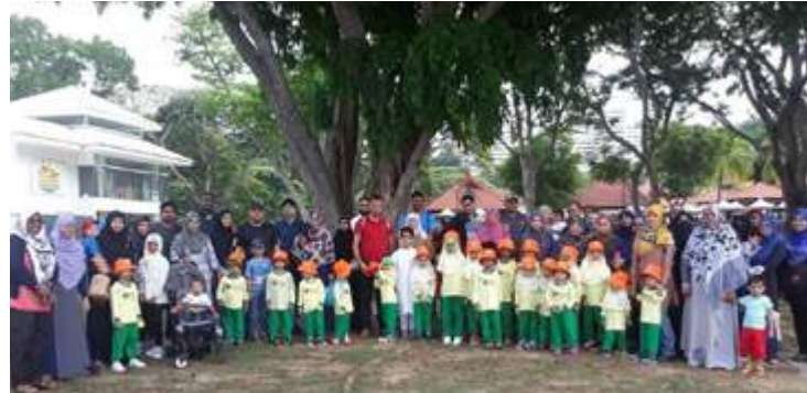
Many hands make the beach clean-up easier, faster and merrier