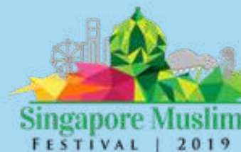
The Singapore Muslim Festival Logo

The watermark background features Singapore’s iconic buildings and the nation’s skyline. It evokes an inclusive national event that welcomes all Singaporeans and everyone who are on this island during that period.