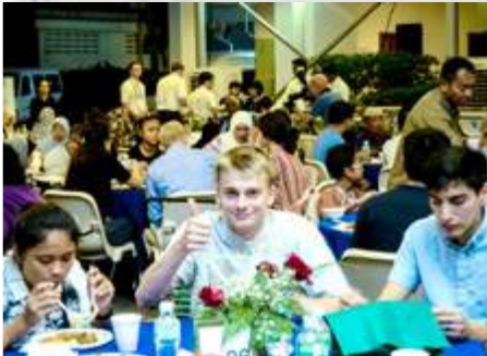
Some of the multi-faith guests at Jamiyah's Community Iftar at The Church of Jesus Christ of Latter-day Saints on 27 May 2019