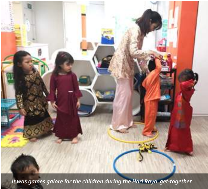
It was games galore for the children during the Hari Raya get-together