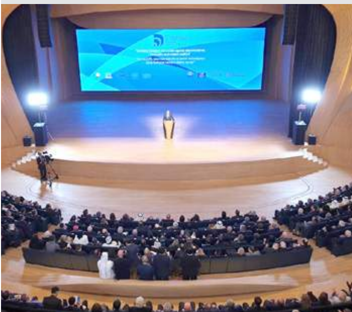
Around 500 participants from 100 countries attended the Forum

Officially opened by the President of Azerbaijan, Ilham Aliyev, the World Forum was attended by Speakers and Representatives of more than 100 countries. The President highlighted and showcased the experience of Azerbaijan in building a united and cohesive multicultural society, and wished that other countries can do the same, especially in these times when hatred, antagonism, and extremism are regular occurrences in the world.