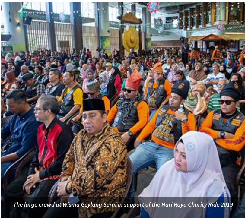
The large crowd at Wisma Geylang Serai in support of the Hari Raya Charity Ride 2019