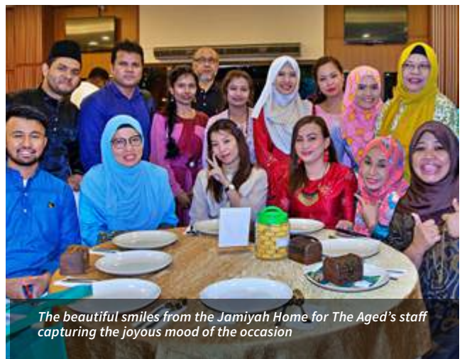
The beautiful smiles from the Jamiyah Home for The Aged's staff capturing the joyous mood of the occasion