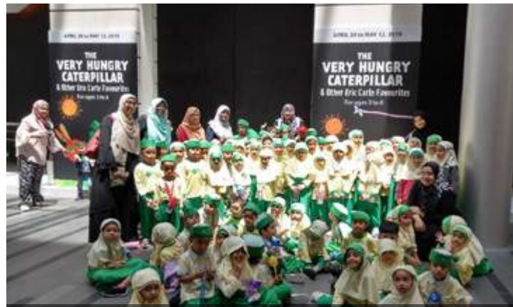
JK students get an early introduction to the arts scene

Our JK children had great fun watching three stories from famous children author Eric Carle come to life in plays at Victoria Theatre on 10 May 2019. The Very Hungry Caterpillar enchanted them as it chomped away anything and everything as it transformed into a beautiful butterfly. Then came the bored Little Cloud who went on a thrilling adventure transforming itself into an airplane, a sheep, clown and shark. In The Mixed Up Chameleon who did not think much of its ability to change colours every day, the children learnt about the importance of appreciating their own uniqueness.