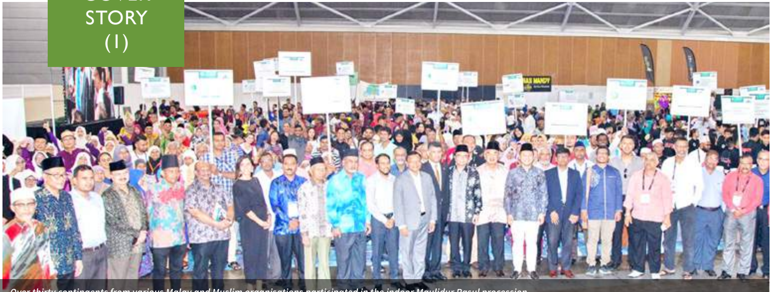
Over thirty contingents from various Malay and Muslim organisations participated in the indoor Maulidur Rasul procession