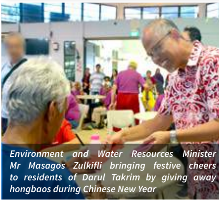
Environment and Water Resources Minister Mr Masagos Zulkifli bringing festive cheers to residents of Darul Takrim by giving away hongbaos during Chinese New Year