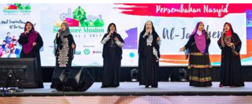
The Most Inspirational Event of This Year also featured the popular nasyid group, Al-Jawaher