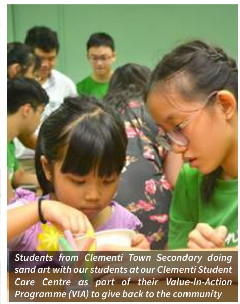
Students from Clementi Town Secondary doing sand art with our students at our Clementi Student Care Centre as part of their Value-In-Action Programme (VIA) to give back to the community