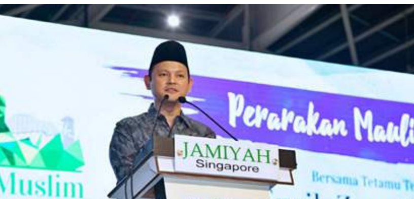
Mr Zaqy Mohamad, Minister of State for National Development and Manpower, was the Guest of Honour for the contingent marching event