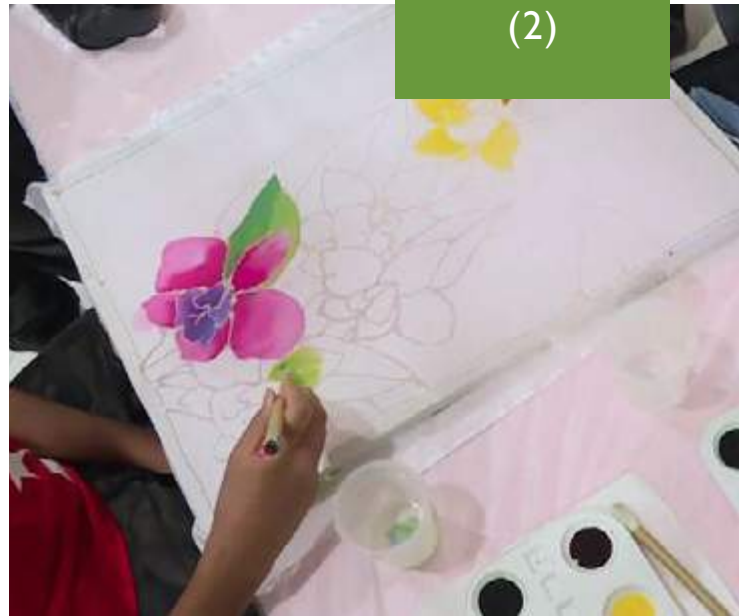
A joint masterpiece of batik painting by a Darul Ma'wa resident and his counterpart from the visiting group