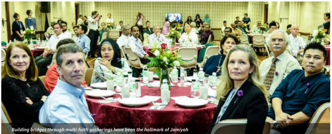
Building bridges through multi-faith gatherings have been the hallmark of Jamiyah

As part of sharing the blessings of Ramadan with the less fortunate, 55 needy families from Jamiyah and the LDS received food rations and cash gifts donated by the Heartwarmers Volunteer Group. Apart from the LDS, Jamiyah also received donations from other well-wishers, such as Chettiars’ Temple Society, Malabar Gold and Diamonds, Minora Centre and Bengawan Solo.