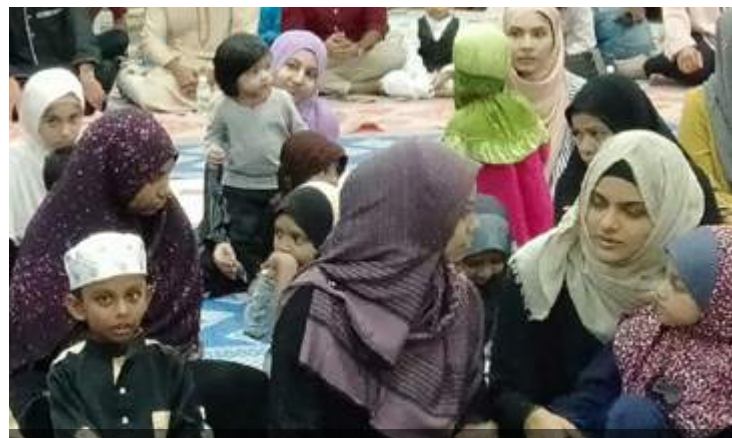
An iftar is always a great way of bringing everyone together

An iftar (breaking of fast) for the JK family – students, parents and teachers – was held on 17 May 2019 at Level 5 in Jamiyah headquarters. It is always a heartwarming experience to break fast and praying together as it strengthens the positive spirit of camaraderie or “gotong royong” amongst us. Parents were very happy that they were part of this event as they ate and mingled with staff and other parents.