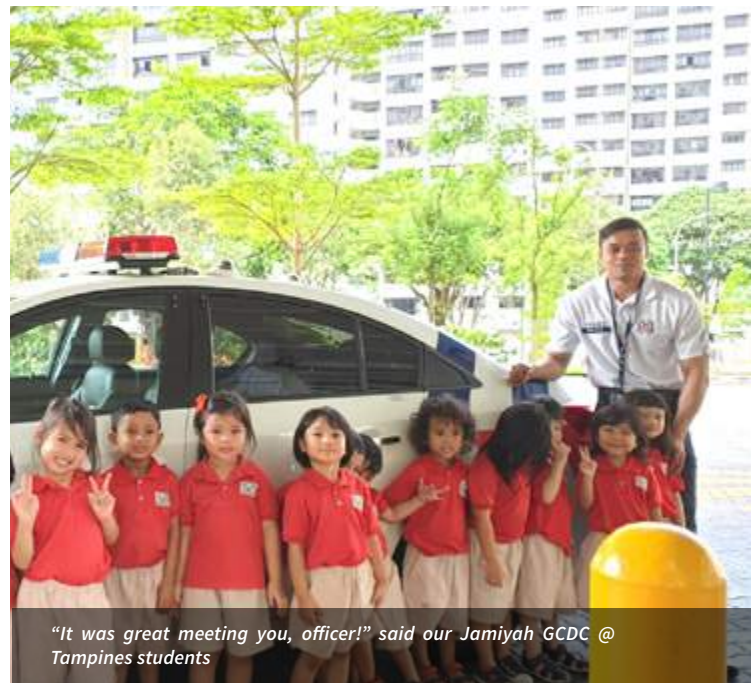
"It was great meeting you, officer!" said our Jamiyah GCDC @ Tampines students