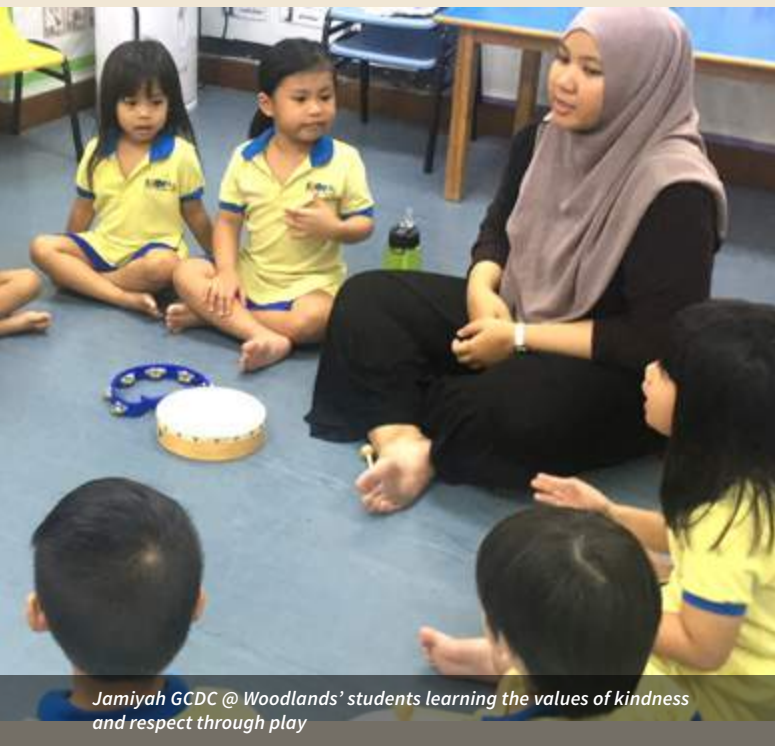
Jamiyah GCDC @ Woodlands' students learning the values of kindness and respect through play