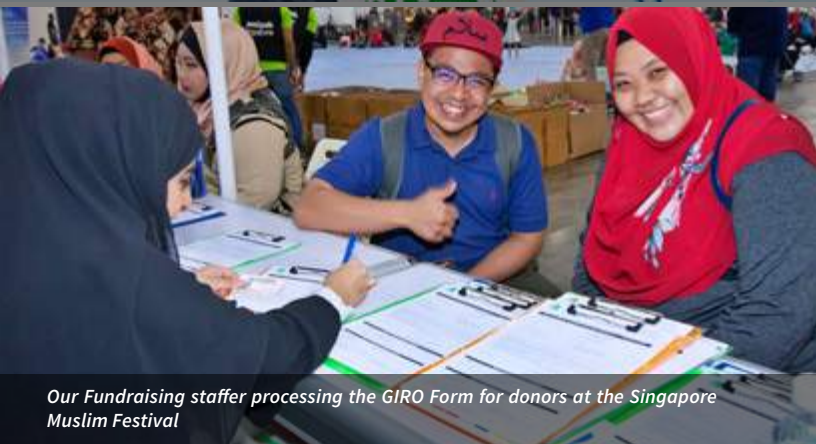
Our Fundraising staffer processing the GIRO Form for donors at the Singapore Muslim Festival