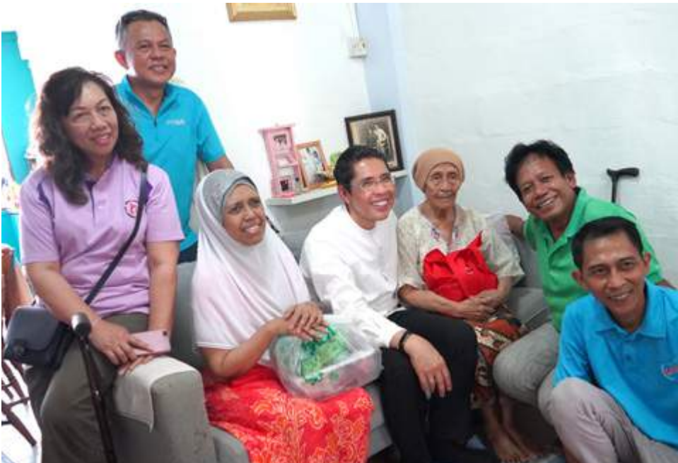
Dr Mohamad Maliki Osman, Mayor, South East District and Senior Minister of State for Defence and Foreign Affairs, flanked by mother and daughter - both recipients of food rations - at their Bedok home during the Meat For The Needy distribution

I n this year's Meat For The Needy distribution, our Community Outreach and Development and Department (CODD), collaborated with five constituencies – Sembawang GRC, Jurong GRC, Macpherson SMC, Marsiling-Yew Tee GRC, and East Coast GRC. The recipients comprised beneficiaries from the various races and faiths in Singapore.