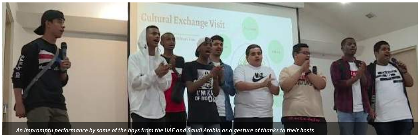
An impromptu performance by some of the boys from the UAE and Saudi Arabia as a gesture of thanks to their hosts

Such people-to-people interactions will certainly help in strengthening the relationship between Singaporeans and communities from the Middle East and elsewhere.