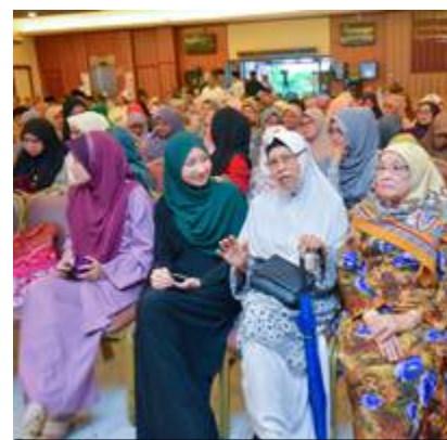
The Al-Malik Faisal Hall was packed with both young and old, from all walks of life