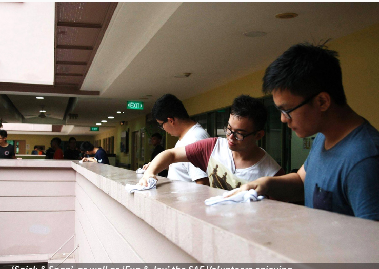
'Spick & Span' as well as 'Fun & Joy' the SAF Volunteers enjoying their experience and exposure @ Jamiyah Nursing Home (JNH)

The four academies are the Academy of Performing Arts, Academy of Batik, Academy of Music and Academy of Sports.