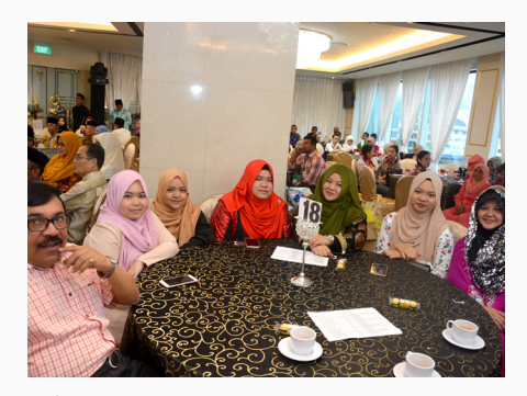
Finance Department Best Department of the Year 2015

Quote that I live by: "Be passionate in whatever you do, and give your best. What you deserve will come to you."