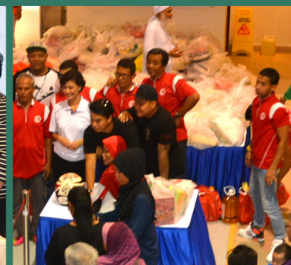
Annual General Meeting Opening Of Senior Care Centre and Dementia Ward