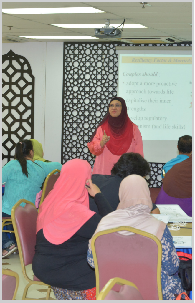
Resolved to change their lives for the better, participants of the 'Empowering Families with Education' sharing their thoughts