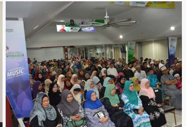
The attentive audience at ‘Ada Syurga Di Rumahku’