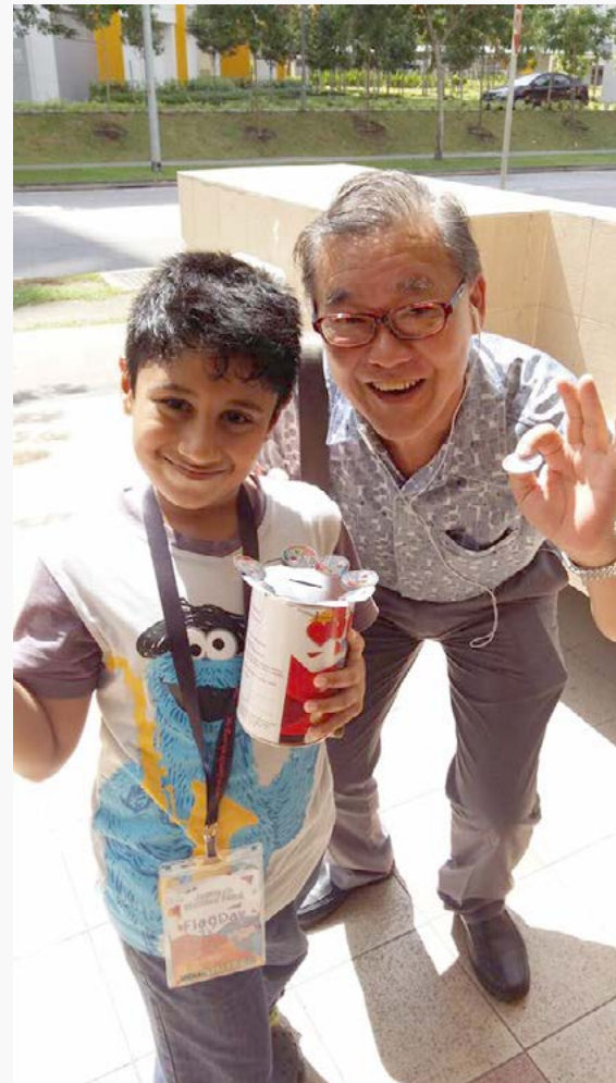
Happy volunteers at the Flag Day 2016

Jurong East, Admiralty, Bedok, Bishan and Bugis MRT station.