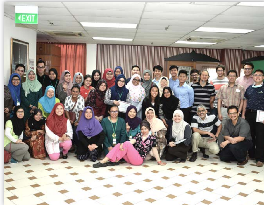
The team of volunteers from MHPA: from us, ‘thank you!’