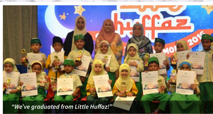
"We've graduated from Little Huffaz!"