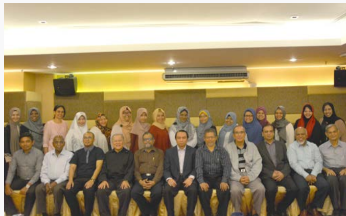
Some HODs with Senior Management of Jamiyah