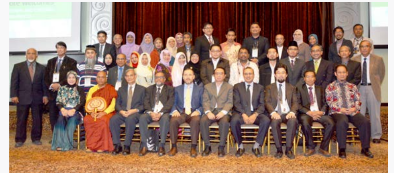
Speakers, Delegates and Organizers