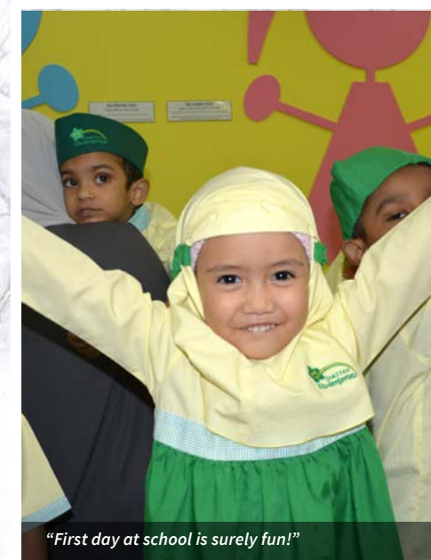
"First day at school is surely fun!"