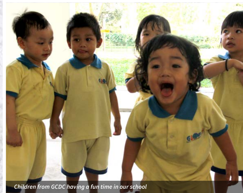
Children from GDCD having a fun time in our school