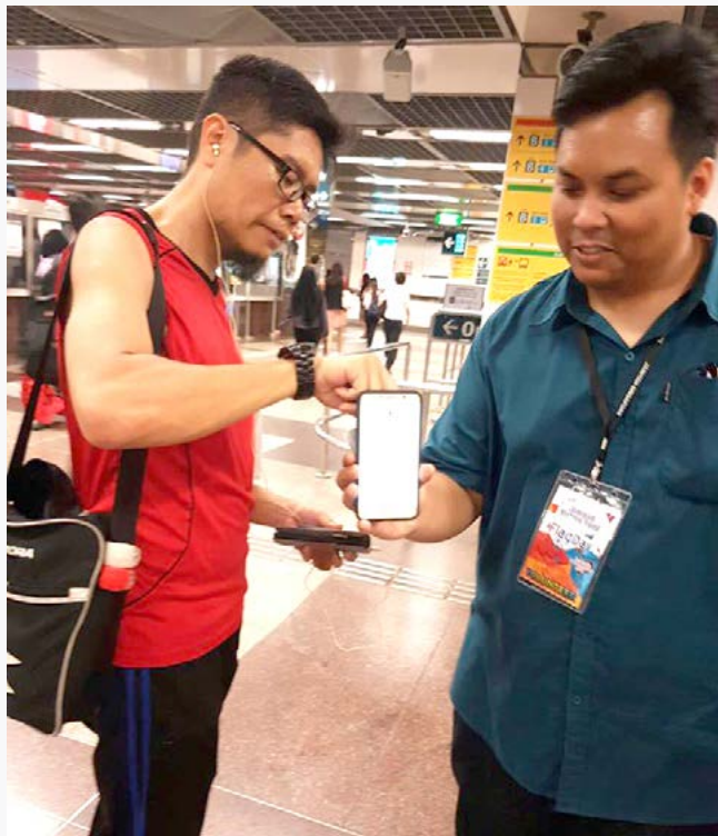
14 A donor tapping his EZ Link card onto a volunteer's smartphone

Some 200 staff and volunteers participated in the activity, with the collection point located island-wide including