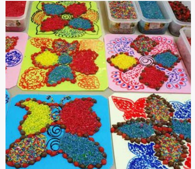
Coloured rice rangoli

The residents and staff were very happy to be part of this art project especially when Rangoli Radiance made it to the Singapore Book of Records. For their hard work, creativity and participation, the Home was given a certificate. JHA has another reason to be proud: Rangoli Radiance was their second recognition and contribution to the national records. In 2015, the residents made collages with multi-