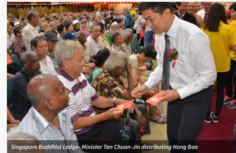
Singapore Buddhist Lodge- Minister Tan Chuan-Jin distributing Hong Bao

The presence of Jamiyah’s staff at Singapore Buddhist Lodge’s event, working together with their staff and volunteers, reflects the cohesion and friendship between the two organisations, and goes along well with Singapore’s multi-racial way of life.