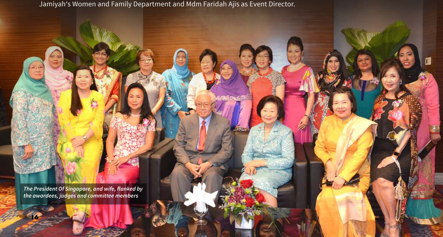
The President Of Singapore, and wife, flanked by the awardees, judges and committee members