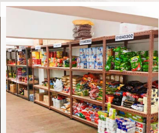
Neatly arranged items at the warehouse

Jamiyah warmly welcome all members of the public to support its Food Bank by donating any food items that will be distributed to the less privileged.