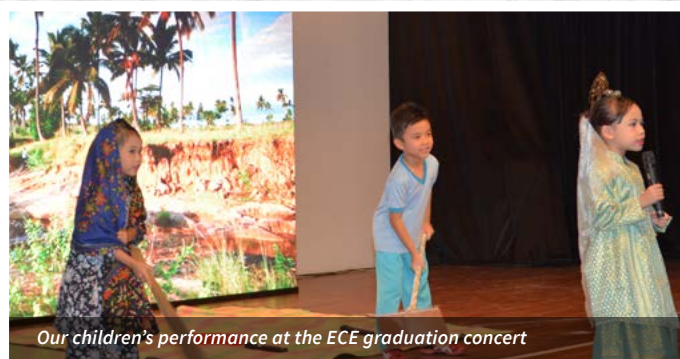
Our children's performance at the ECE graduation concert