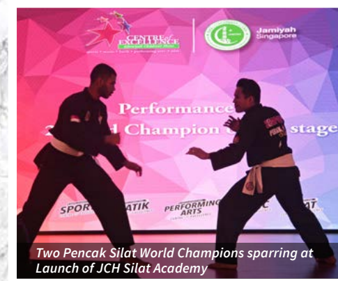
Two Pencak Silat World Champions sparring at Launch of JCH Silat Academy