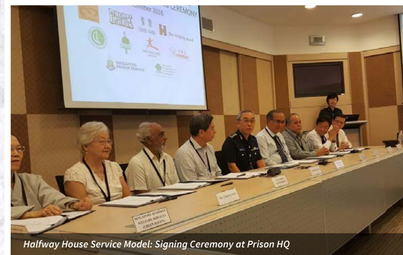
Halfway House Service Model: Signing Ceremony at Prison HQ