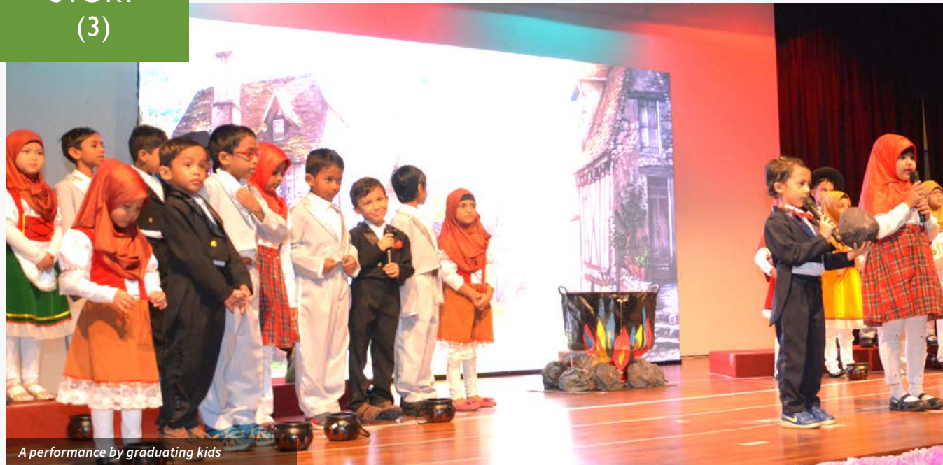
A performance by graduating kids