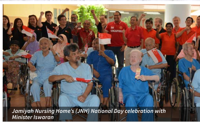
Jamiyah Nursing Home's (JNH) National Day celebration with Minister Iswaran