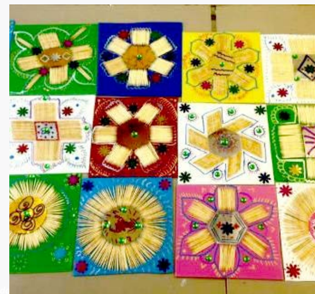
Toothpick rangoli, one of the rangolis that won the award