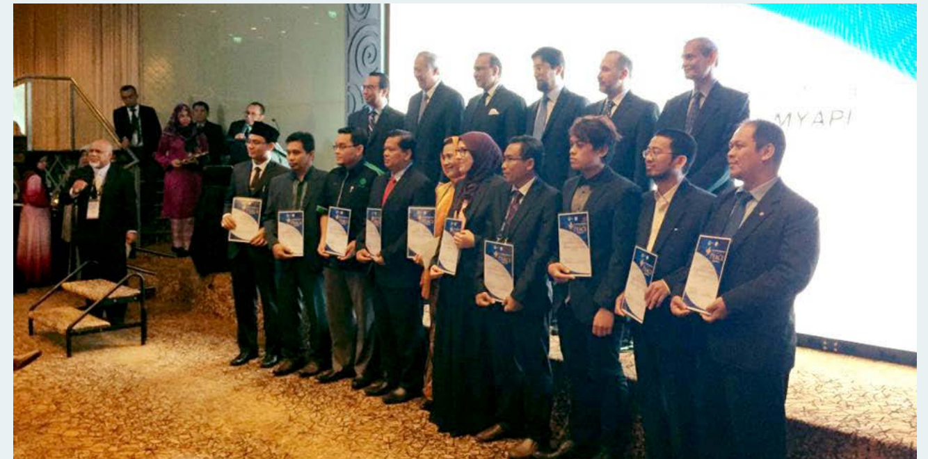
Newly appointed MYAP: Spreading message of Peace, wherever we go!

In October 2015, Jamiyah Singapore appointed 20 Muslim Youth Ambassadors of Peace (MYAP) at a Muslim Youth Seminar held jointly by Jamiyah, the Federation of Indian Muslims, Singapore Kadayannur Muslim League (SKML), and Indian Muslim Professionals. MYAP was formed to spread the message of peace, targeting the youths as they are more vulnerable to radicalism.