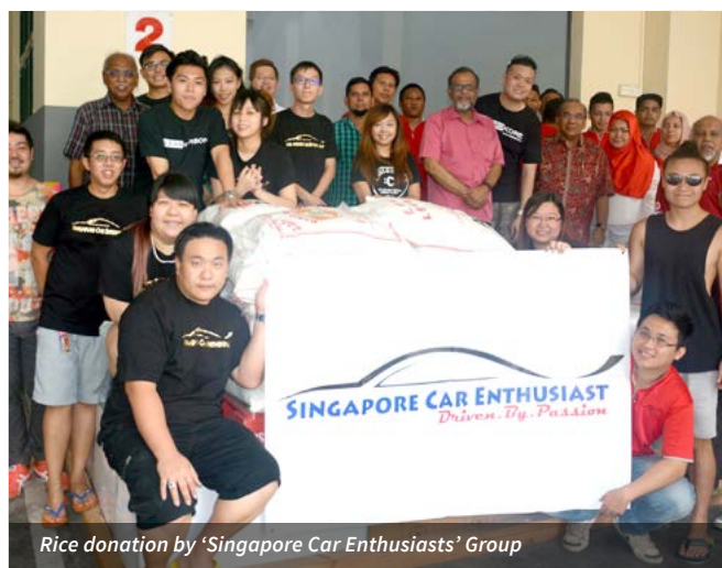
Rice donation by 'Singapore Car Enthusiasts' Group