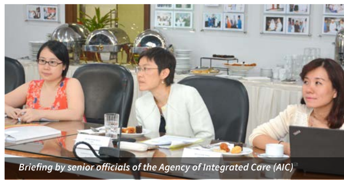
Briefing by senior officials of the Agency of Integrated Care (AIC)