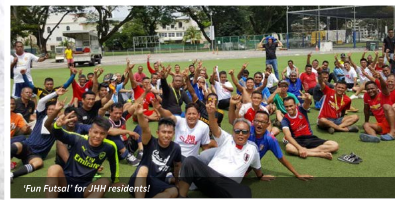
'Fun Futsal' for JHH residents!