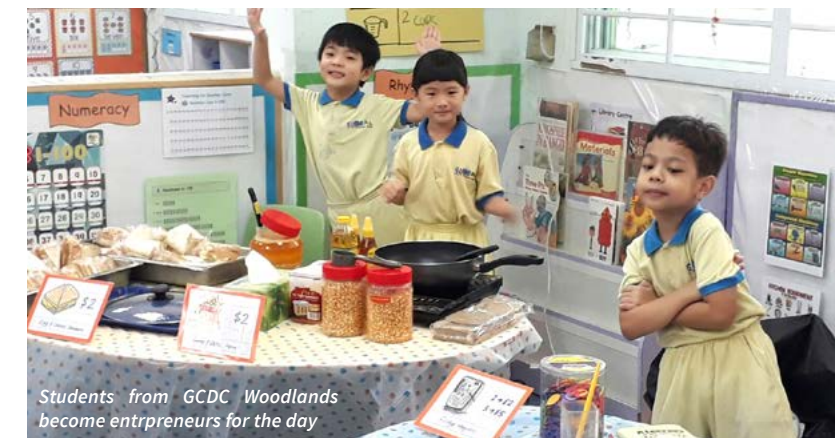
Students from GCDC Woodlands become entrepreneurs for the day

This Family Day was meant to engage parents to be involved in activities that their children are involved in the school. The K1 children showcased their collaborative 3D work and had a great time exploring the tech toys. K2 students set up a small stall in the classroom to sell homemade popcorns, lemon tea and handmade magnet crafts.