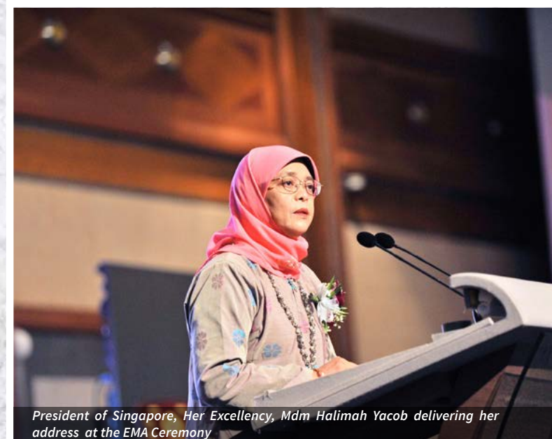
President of Singapore, Her Excellency, Mdm Halimah Yacob delivering her address at the EMA Ceremony