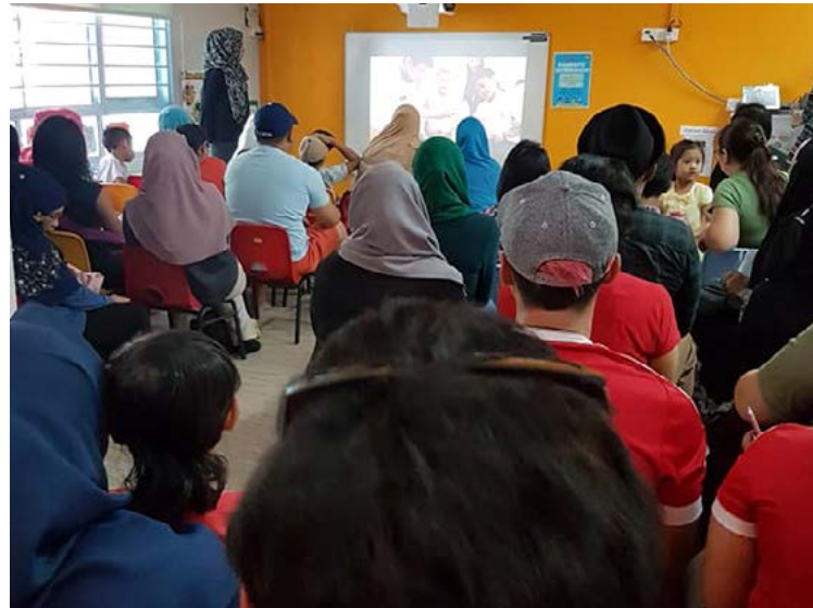
Parents were briefed about what to expect for Primary 1 by our parent volunteer