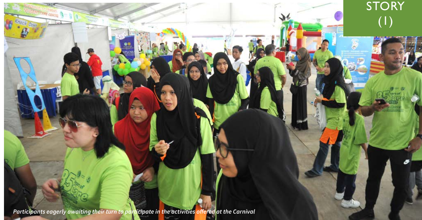
Participants eagerly awaiting their turn to participate in the activities offered at the Carnival

A Carnival, '85 Years of Care: Jamiyah Moves with the Community', was held on the 14th and 15th May 2017, launching a series of events celebrating the organisation's 85th anniversary.