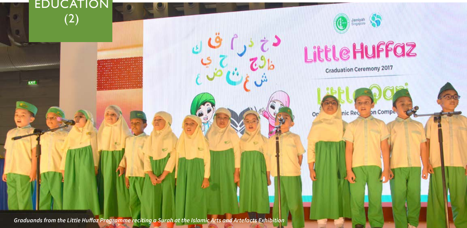
Graduands from the Little Huffaz Programme reciting a Surah at the Islamic Arts and Artefacts Exhibition