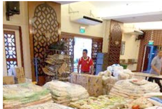
Food items packed and ready for distribution