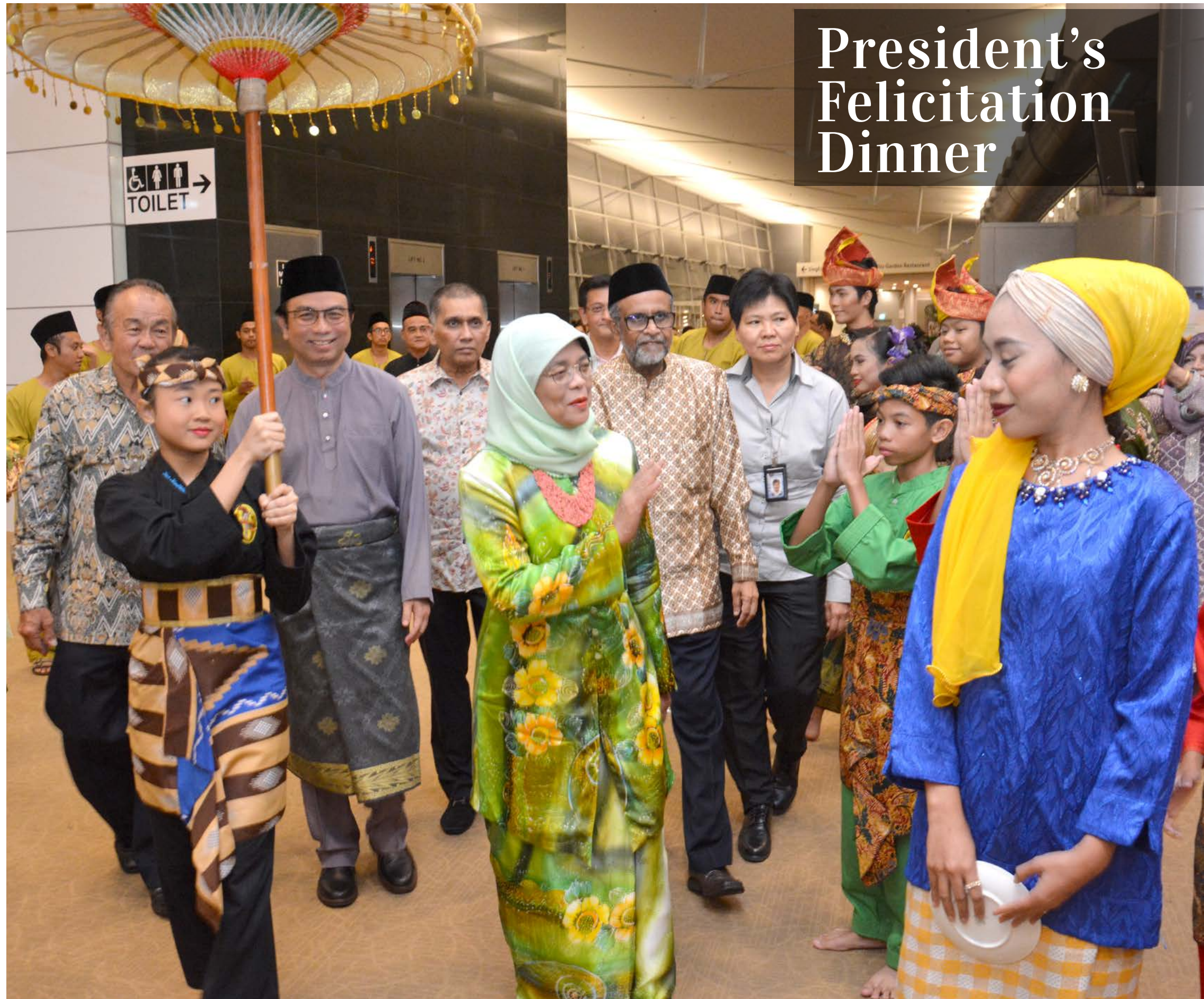
The arrival of Guest of Honour, President of Singapore, Her Excellency, Mdm Halimah Yacob at the Felicitation Dinner

In her address, President Halimah said, she is humbled by the numerous well-wishes from Singaporeans and congratulated Jamiyah Singapore on its service mission and numerous services to the Malay/Muslim community and Singapore.