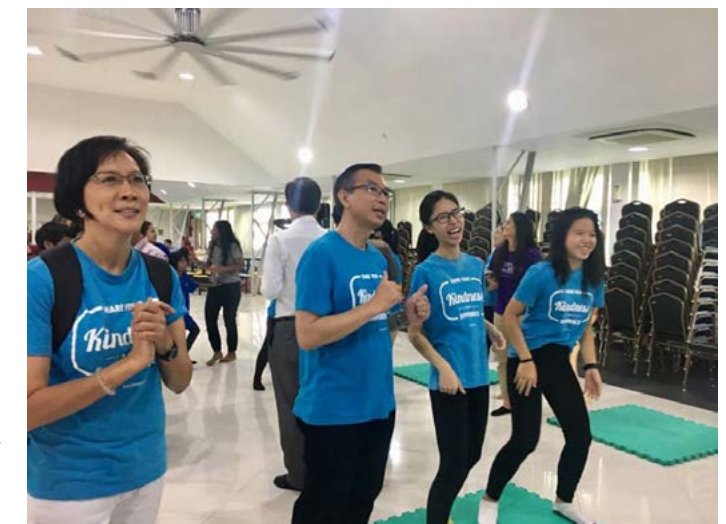
Visitors entertaining the residents of Jamiyah Children’s Home

the dinner, chaperoned by our ever-present staff, residents enthusiastically dressed up for the occasion and were eager to apply their newly-learnt skills. From their feedback about the dinner, it was a sponsorship worth every dollar that our donors put in. Alhamdulillah!