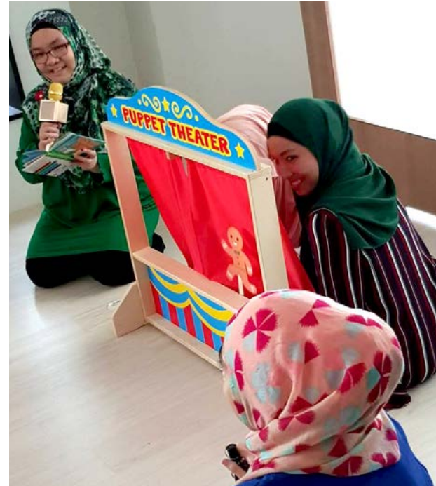
Teachers during a story telling session at the Centre

Ever since the launch, there has been considerable interest, so much so that a total of eighty parents have enrolled in the Program. So far, with greater awareness and knowledge of what are being offered. We expect more enrolment.