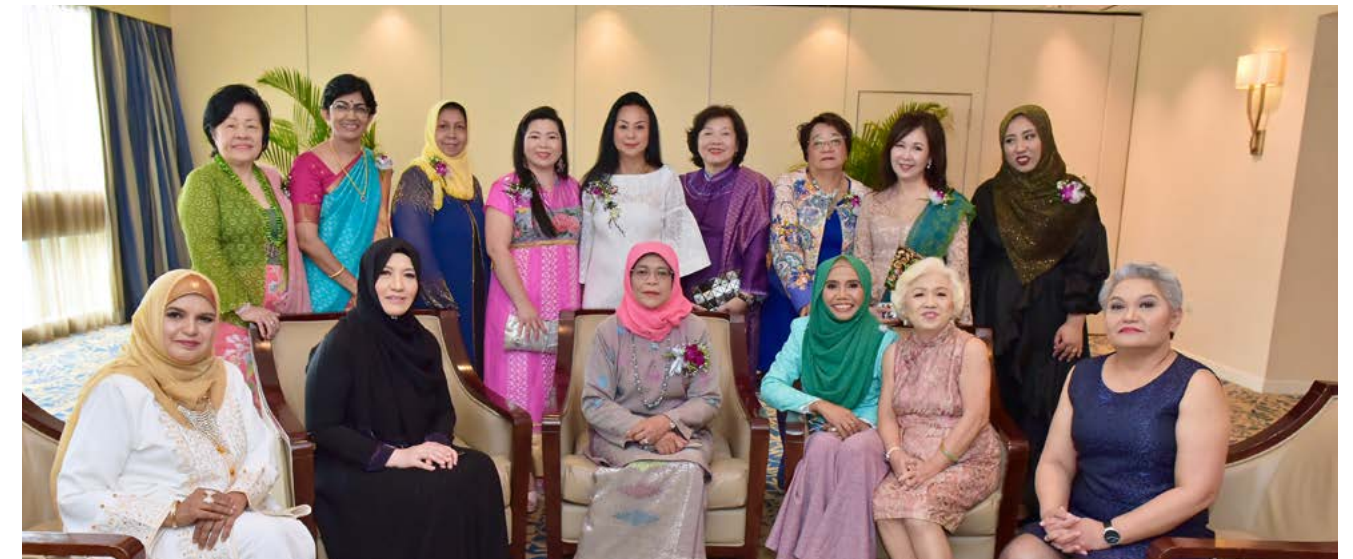
Finalists of the Exemplary Mother Award 2017 with the President of Singapore, Her Excellency, Mdm Halimah Yacob, and Panel of Judges

The evening ended with musical performances by the Teng Ensemble, a not-for-profit organisation that provides a platform for exceptional Singaporean musicians with an environment to experiment and create original music. Their performances in various cities across the world and their online music videos have received much attention and viewership.