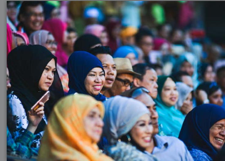
Viewers anticipating the performances of their favourite artistes

The event was graced by the presence of Minister for the Environment and Water Resources, Mr Masagos Zulkifli Masagos Mohd.