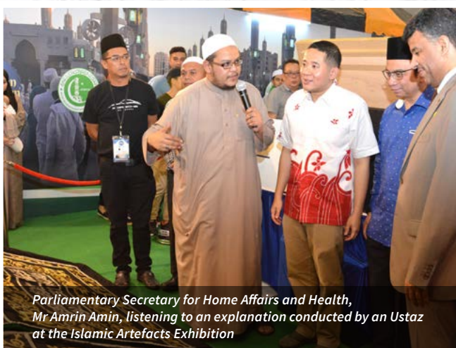
Parliamentary Secretary for Home Affairs and Health, Mr Amrin Amin, listening to an explanation conducted by an Ustaz at the Islamic Artefacts Exhibition