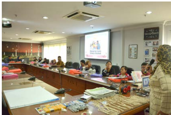
Empowering and Caring Family Programme (ECF) in progress