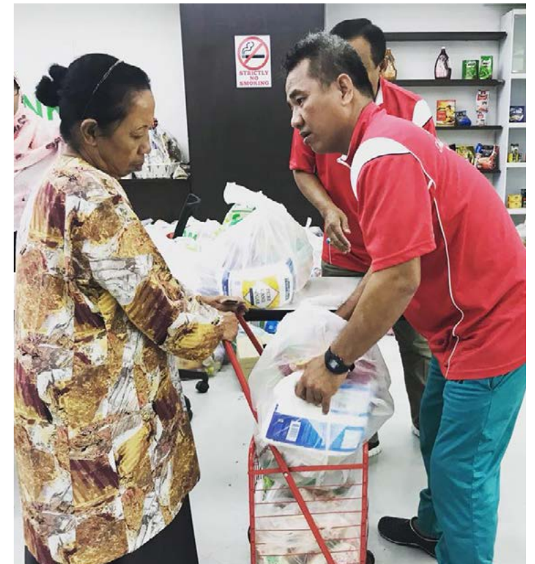
Volunteers distributing food ration to local beneficiaries

Each beneficiary received a two months' supply of food rations, including items such as rice, canned food, cooking oil, cereal and meats.