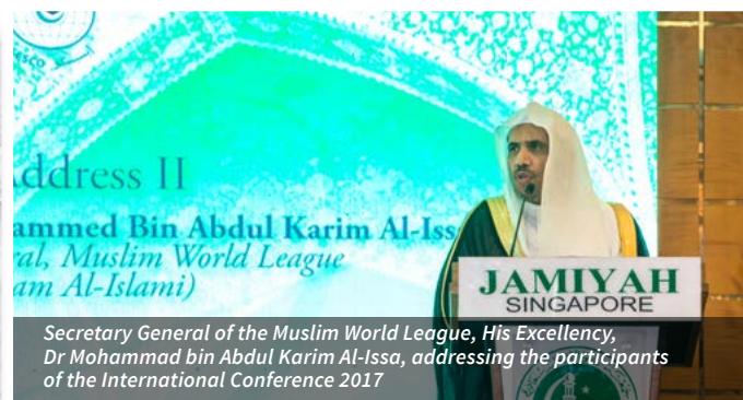
Secretary General of the Muslim World League, His Excellency, Dr Mohammad bin Abdul Karim Al-Issa, addressing the participants of the International Conference 2017