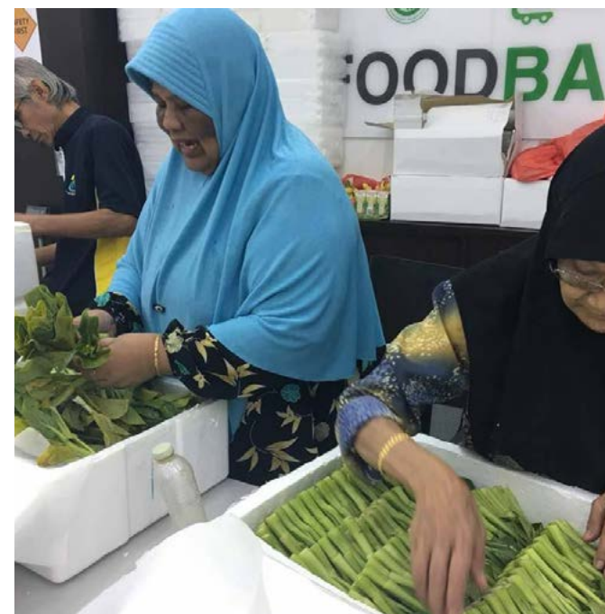
Volunteers getting food items ready for distribution