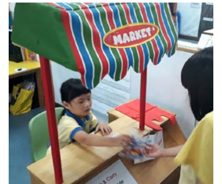
Students engaged in the Entrepreneurial Dare

They were actively involved in carrying out their duties and were seen promoting the items to the parents. The result of their efforts: the K2 kids managed to raise $251 from the sale of items-double the $100 target!