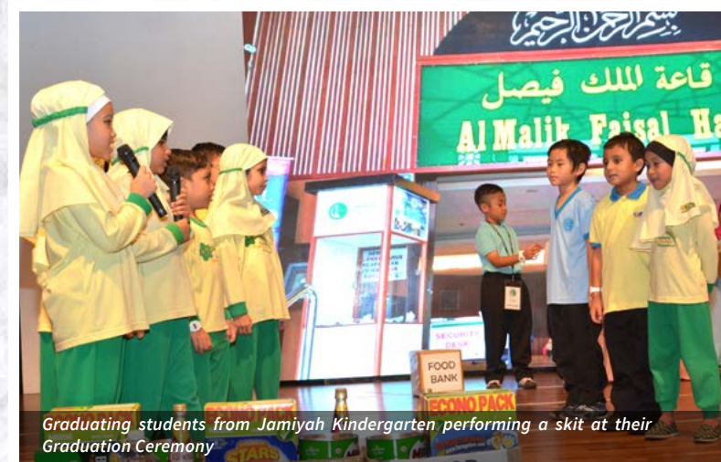
Graduating students from Jamiyah Kindergarten performing a skit at their Graduation Ceremony