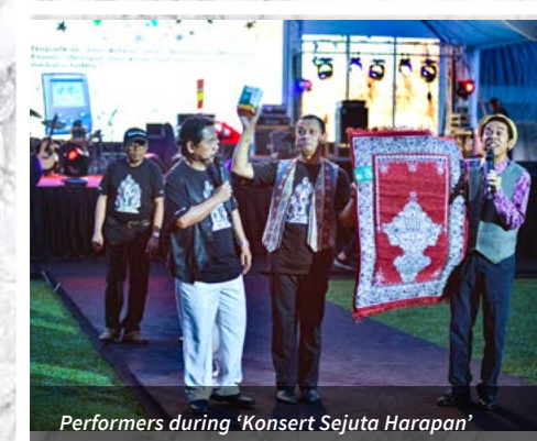
Performers during 'Konsert Sejuta Harapan'