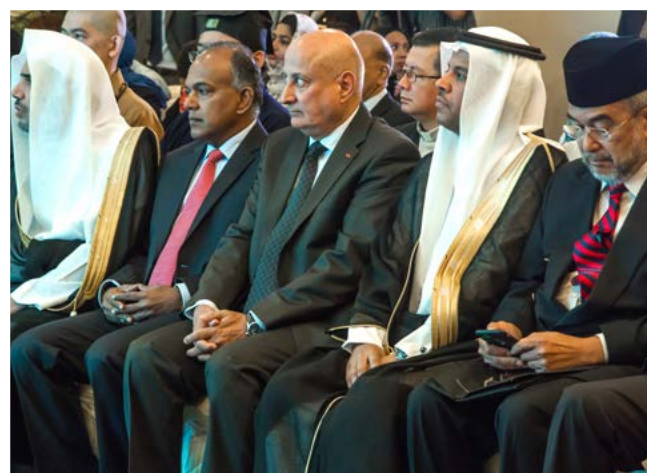
Distinguished guests at the International Conference 2017