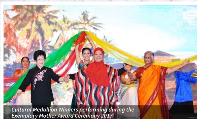
Cultural Medallion Winners performing during the Exemplary Mother Award Ceremony 2017