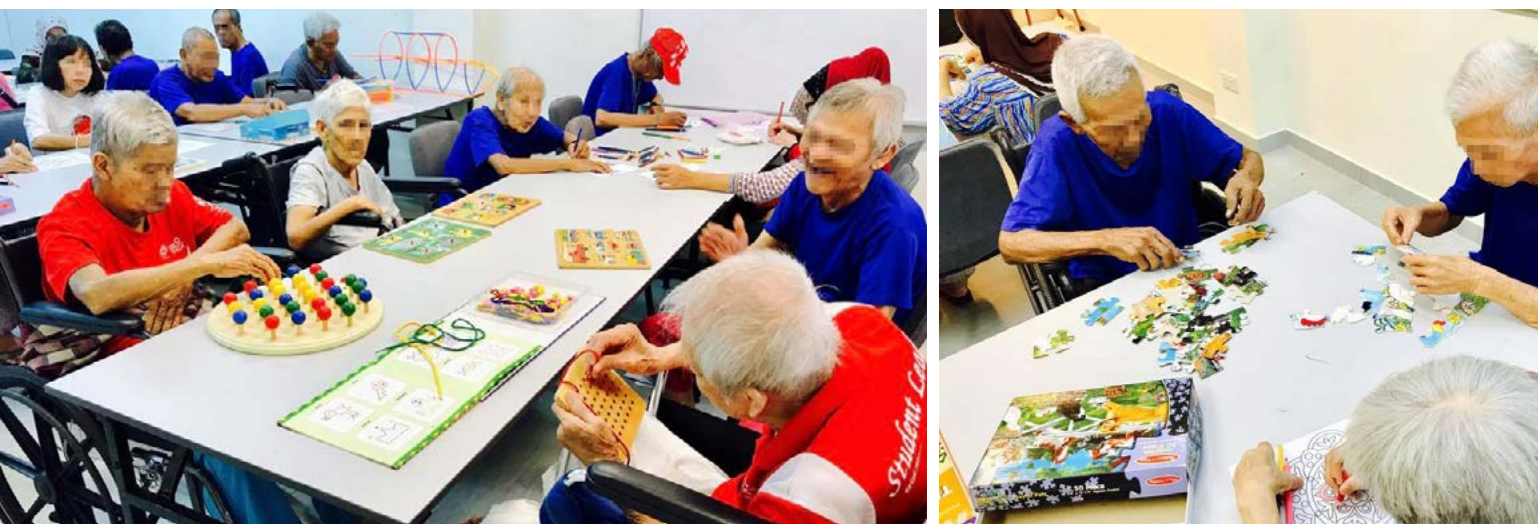
Residents of Jamiyah Home for the Aged engaged in an activity

Located right in the middle of Tampines neighbourhood, the Soka Association, the Tampines West CC, and the People’s Associaton Club, is the Jamiyah Home for the Aged (Darul Takrim). Established in 1973, the Home housed some 141 residents who shares some common characteristics- they are aged, need a sanctuary and hope to live their remaining life with peace and happiness.