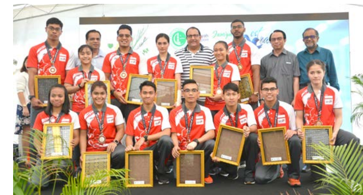
SEA Games 2017 silat medalists honoured at Jamiyah @ West Coast

a youth mentorship programme; and, The Church of Jesus Christ of Latter-day Saints to provide a tuition and self-enhancement programme. During the launch of Jamiyah @ West Coast, Jamiyah Singapore was also presented the Chartered Certificate by the Toastmasters Club of Singapore for the setting up of Singapore's first Malay Toastmasters Club.