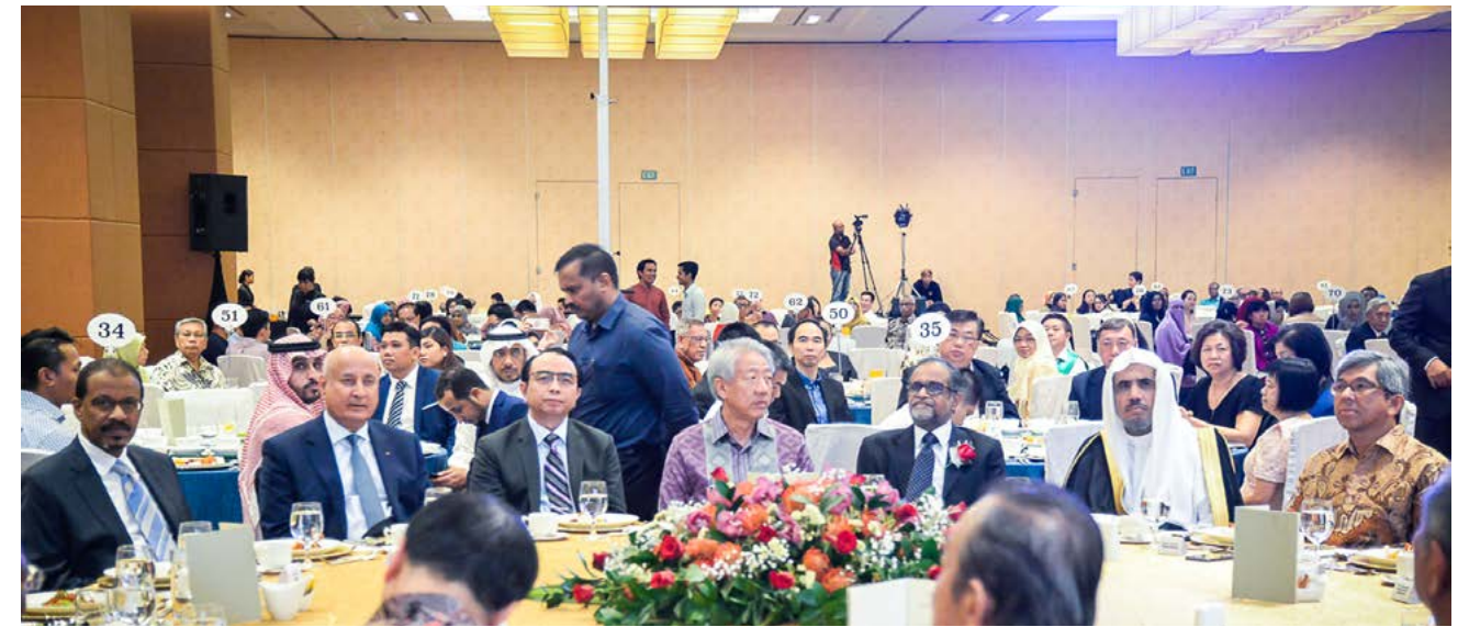
Distinguished guests at the 85th Anniversary Gala Dinner

A 'Gala Dinner' was held as a finale to Jamiyah Singapore's 85th anniversary celebrations, and the occasion witnessed the launching of an educational scholarship and an award ceremony honouring a few distinguished leaders in the Muslim world.