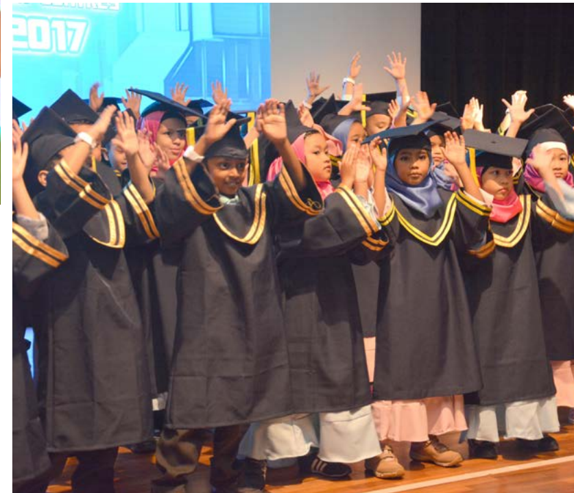
Students from Jamiyah Kindergarten celebrating the graduation at the Combined Graduation Concert 2017