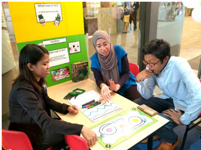
Teachers planning a lesson