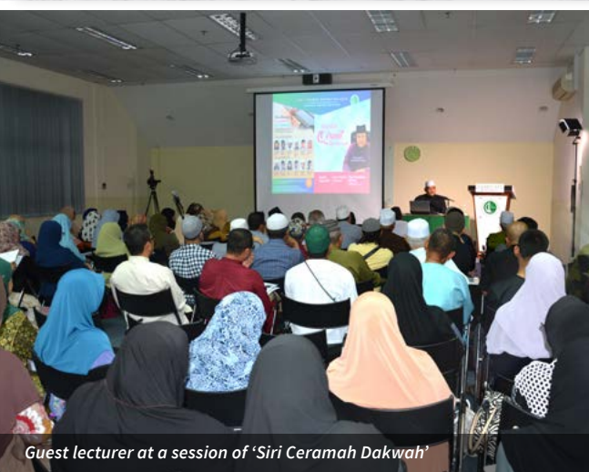
Guest lecturer at a session of 'Siri Ceramah Dakwah'