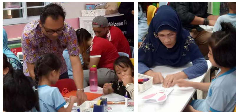
Bonding session through art and craft

A sharing session was conducted by Jamiyah Childcare Centre in November 2017. The parents had a fruitful time understanding the needs for the Kindergarten 2 children who are moving on to primary school. They understand better the curriculum for primary one and how their children could cope with the smooth transition to primary one. The workshop focused on the activities that bond the child and the parents and how parents could support their children academically. At the end of the day, the parents were confident that their children will be able to progress smoothly to the next stage. The staff had supported the parents during workshop with guidance and tools. The children from K1 and K2 later performed some sketches for their parents.