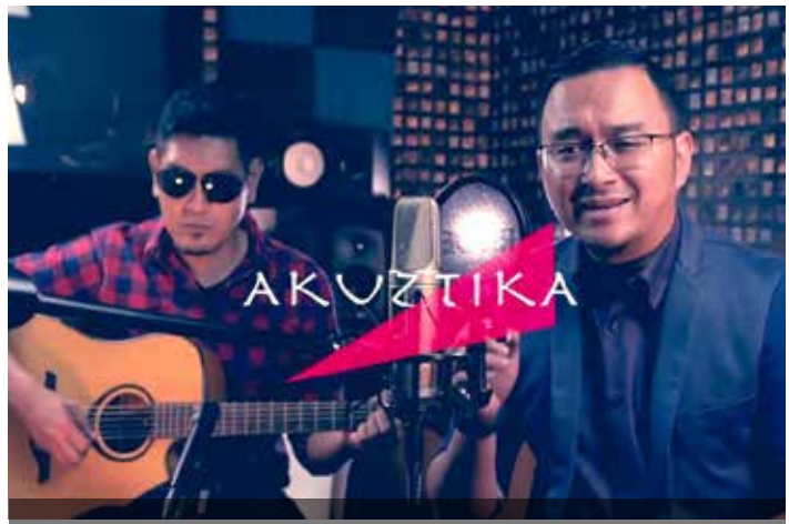
Look out for more Akuztika videos from our Marcom team - watch them all at Jamiyah Singapore's Facebook!

D preading the Message of Islam has always been at the heart of Jamiyah's core activities.