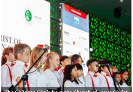
The Children Choir from the Church of Jesus Christ of Latter-day Saints wowed the audience at the Exemplary Mother Award Ceremony in October 2018 with a wonderful performance