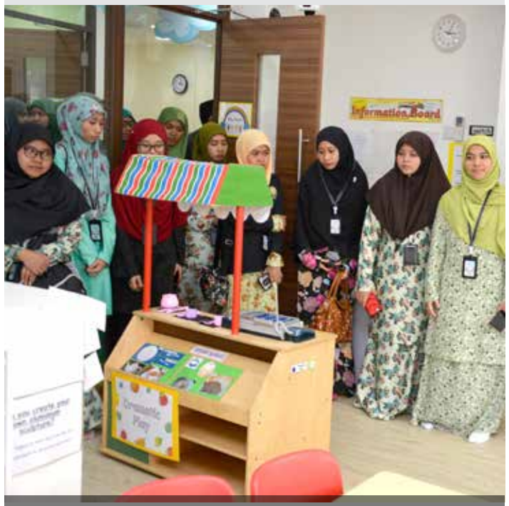
The Seri Begawan Religious Teachers University College delegation at Jamiyah Kindergarten

The visit was part of the ' Rihlah Ilmiah ' programme organised by the Faculty's Kelab Fikrah to forge ties with tertiary students and Muslim communities in other countries with different social and cultural environments from Brunei Darussalam. They visited our Pre-school centres and toured Jamiyah Kindergarten for a first-hand look at the programmes provided. They also made a stop at the FoodBank premises at Tannery Lane as they were impressed when told that it is managed by a team of full-time staff and volunteers in comparison to their setup which is a volunteerrun enterprise.