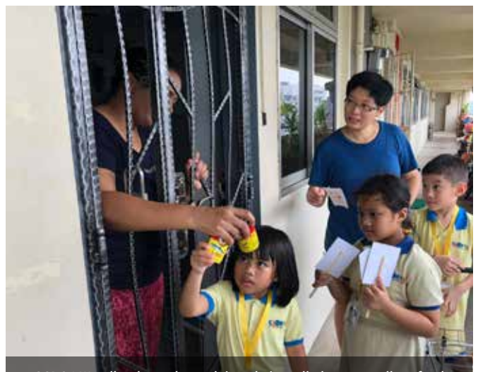
GCDC@Woodlands students doing their walkabout to collect food donations from residents around the neighbourhood

'Kids Give Back 2018' is Jamiyah Global Child Development Centre (GCDC) @ Woodlands' annual food drive event. The community outreach initiative is organised in conjunction with our Centre's theme for the month – food – and with the objective of introducing young children to give back to the less fortunate. Some of the beneficiaries of this project include low-income families, elderly folks, cleaners and foreign workers around the neighbourhood.