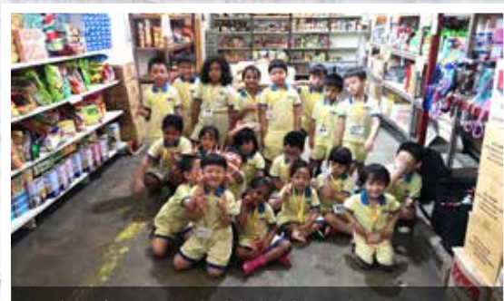
Students from Jamiyah Global Child Development Centre @ Woodlands on a field trip to Jamiyah Food Bank