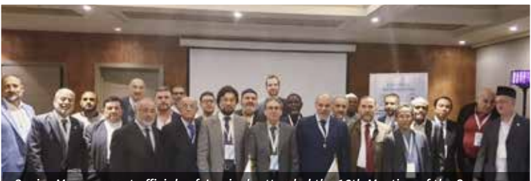
Senior Management officials of Jamiyah attended the 16th Meeting of the Supreme Council for Education, Science and Culture for Muslims outside the Islamic World in Chile in October 2018, organised by Islamic Educational, Scientific and Cultural Organization (ISESCO)