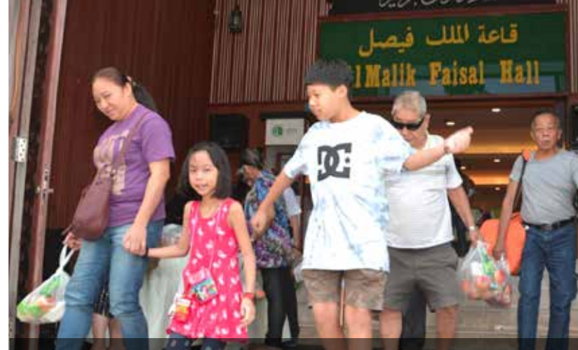
Extra Chinese New Year joy for Jamiyah's beneficiaries as they received food items and a $150 Hong Bao during the annual Fu Dai distribution jointly organised with Heartwarmers Volunteer Group in February 2019