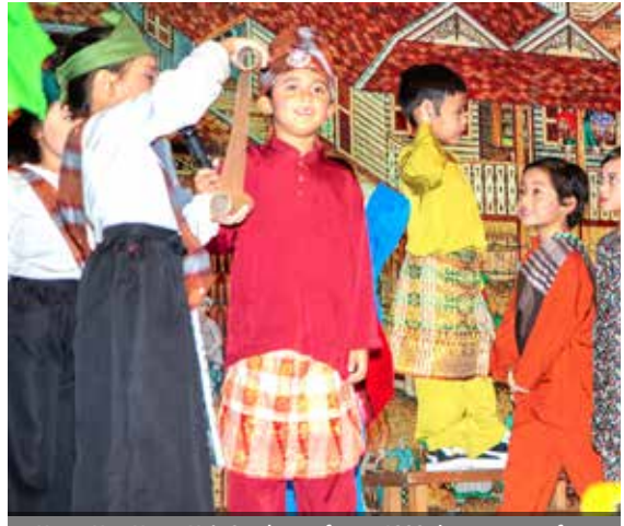
Hear Ye, Hear Ye! Students from JCCC in a scene from 'Singapura Dilanggar Todak'S skit

The acronym for the six learning dispositions, namely 'Perseverance, Reflectiveness, Appreciation, Inventiveness, Sense of Wonder & Curiosity, and Engagement' - the PRAISE framework - is adapted from the Nurturing Early Learners (NEL) curriculum, developed by the Education Ministry to nurture children into lifelong learners. Drawing on local tales such as Singapura Dilanggar Todak and contemporary hits like Shakira's Try Everything , students performed a play or dance to highlight each of the six PRAISE values, to the huge delight of their parents, family members and friends!